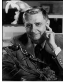
E O Wilson

The world is our workplace. This striking phrase